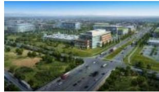
A rendering of the proposed business park looking northwest from the Interstate 70/Central Park Boulevard interchange. The building in the foreground is a 125,000-square-foot office building that is fully designed and can be ready for occupancy in 12 months.

A handful of businesses and agencies, including a solar company, a food distributor and the FBI, are already located in Stapleton. Additionally, Drury Hotels is planning to build a 180-room, eight- or nine-story hotel,