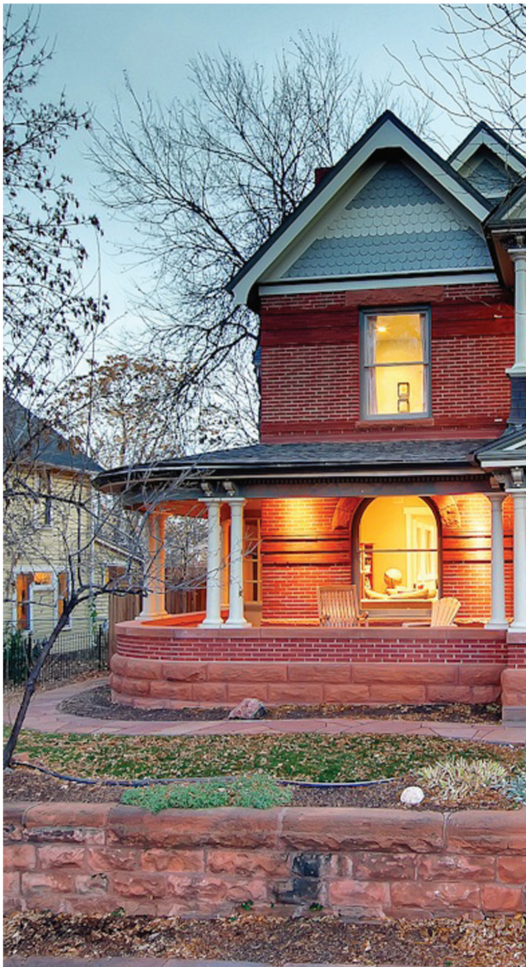
CITY PARK HOME.

"These densely populated neighborhoods in the heart of the city have everything within walking distance: bars, fine dining, fast food, music venues, boutiques, convenience stores