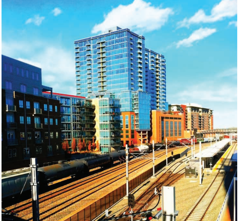
LODO/UNION STATION, PHOTO BY SIMON O' MAHONY

Lower Downtown, which borders Park Ave. West, Lawrence St., the South Platte River and Speer Blvd., is for the true urbanite. “Residentially, you’ll find 19 th century brick architecture with classic arched windows as well as converted warehouses, renovated historic buildings, high rises and luxury living with many new lofts and condos. Unit prices range from $200,000 to $3 million,” says Howells of Porchlight Real Estate Group. Bordering LoDo is an excellent example of the caliber of living you can find downtown: Residence XXV, a luxury hotel resort living experience above The Ritz-Carlton Denver. With 25 private condos privy to a private lobby, fitness center, spa and valet, doorman and concierge services, this community lands you in the middle of the metro action. Howells sums up LoDo and the surrounding metro area well: “Bustling with shoppers, nightclub hoppers,